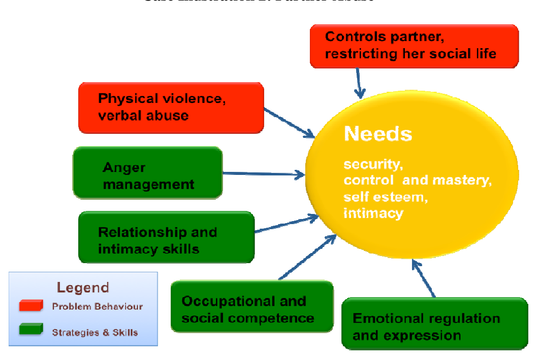
Case Illustration 2: Partner Abuse

stress management, interpersonal and problem-solving skills, and effective pleasure seeking behaviors.