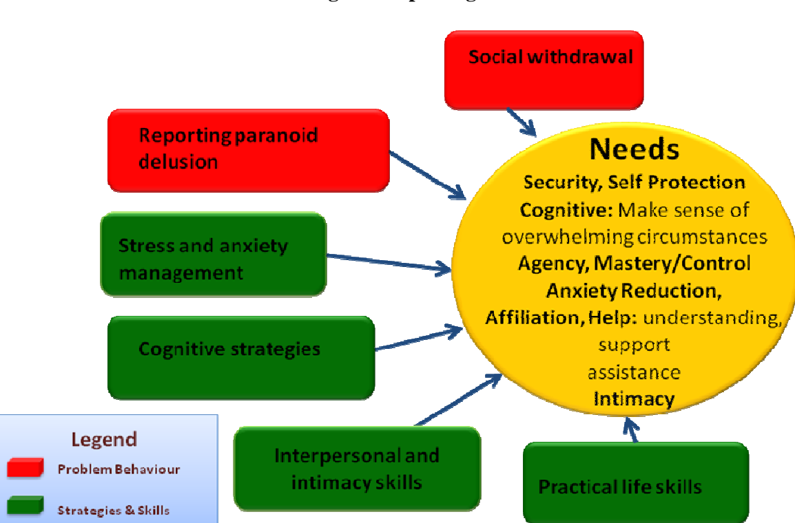
Case Illustration 3: New Immigrant Reporting Paranoid Delusion

We can apply this understanding to another case illustration. Imagine the client is a new immigrant woman reporting paranoid delusion and showing social withdrawal. If we follow a N3C assessment, we will come to the understanding that the client has the cognitive need for making sense, the emotional needs to feel safe and secure, and to reduce anxiety, or perhaps even an agentive need to feel that she is in control. The client needs to be understood and to feel supported and cared for, or being helped. It is possible that the client, upon coming to a new country, found her life circumstances too challenging, and exceeding her capacity . The production of the delusional system can also be understood with regard to certain personal characteristics , such as low self-efficacy, external locus of control, and a tendency of negative reframing.